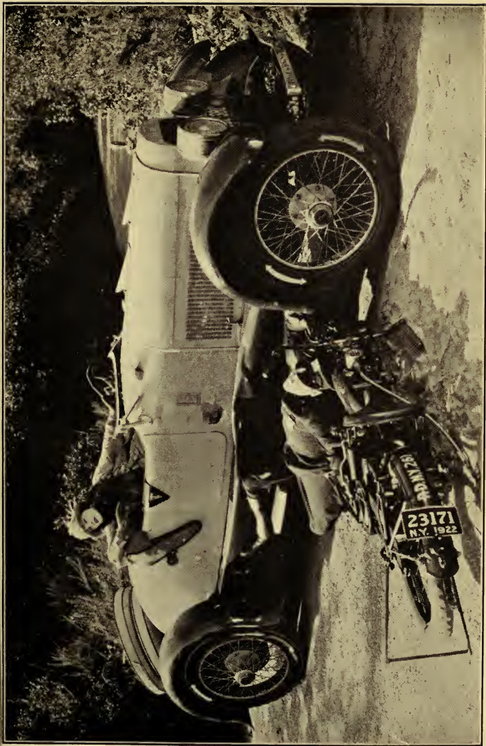
A Paramount Picture

IT WAS A VERY TERRIFYING MOMENT FOR LYDIA.